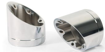
Slash Cut V1 (EK33)