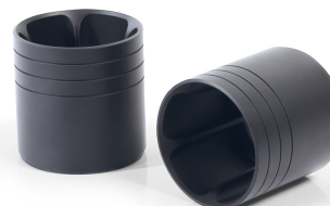
Straight End V2 (EK52)