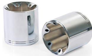
Straight End V1 (EK31)