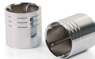
Straight End V2 (EK32)