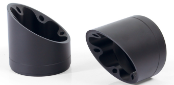
Slash Cut V1 (EK53)