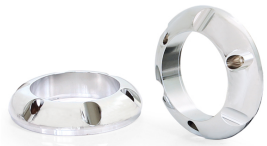
Short Cut V1 (EK30)