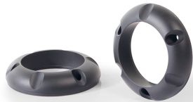
Short Cut V1 (EK50)