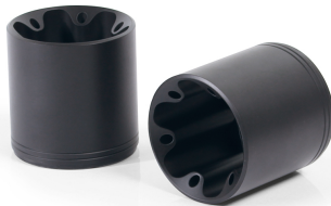
Straight End V1 (EK51)